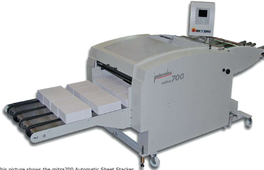
This picture shows the mitra700 Automatic Sheet Stacker.

The Mitra can be lined up with any production line for single sheets, dies, blanks etc. – even for multiple up production. After spreading the streams the mitra counts the sheets and stacks them to perfect blocks. By reaching the selected quantity, the stacks will be pressed to remove the air and delivered into running direction. With the mitra you have the perfect solution in automated handling for all kinds of productions like vertical cutters, die cutters, etc. even at high speed!