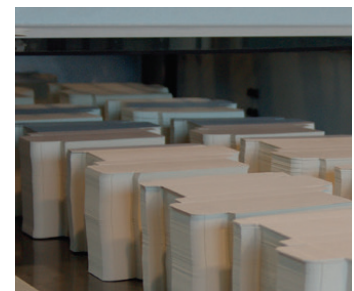
Big product buffer on ergonomic height for up to 6 product streams.

Multiple solutions to help you grow your bottom line.