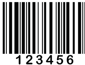
Precision shingle separation via barcode, counter or external signal