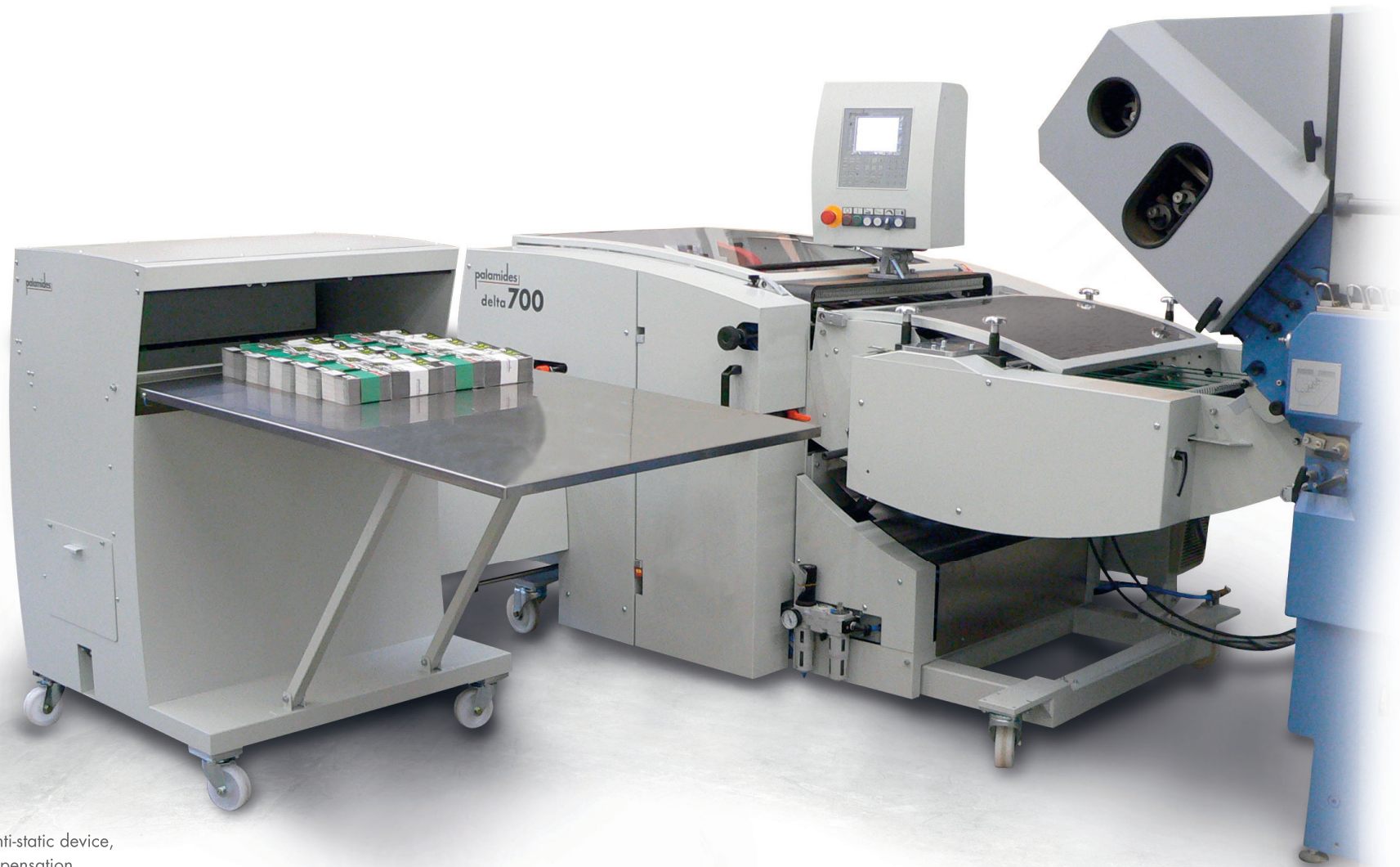
delta703 Automatic Delivery with anti-static device, small format-device and stacking level compensation

With the new automatic delta delivery the focus is on higher productivity with lower personnel costs. Sturdy, easy-to-handle stacks ensure effective removal to subsequent processing machines.