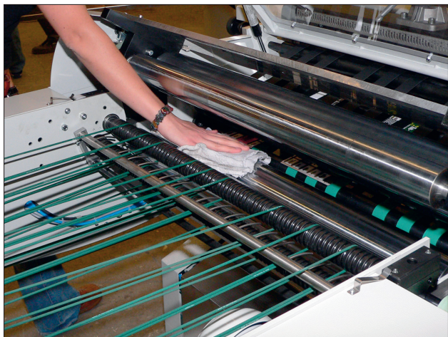
Pressing unit can be opened pneumatically so that the pressing rollers can be cleaned and double sheets can be removed quickly and easily.

Trouble-free sealing of the band is ensured with the sturdy, reliable electronic impulse welding system (EIS). Bundling is only carried out in the shaft in which the products are collected. This patented process ensures that even products which spread out at the binding edge, are slippery and are uneven can be processed neatly.