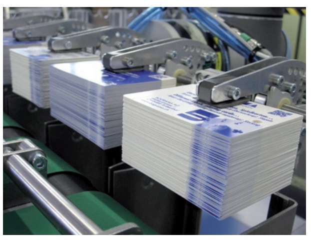
BSR 550 Servo in combination with "RoboStack"; Automated sorting and packaging solution for filling trays, banding or placing on a belt.