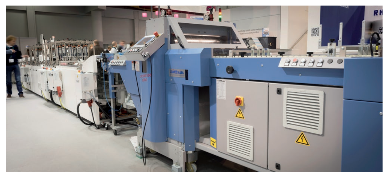
Packaging-Line "Stamina", consisting of BSR 550 Servo with pallet feeder and Herzog + Heymann folding carton line.