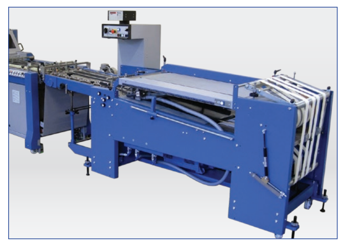
BSR 550 Servo with continuous feeder