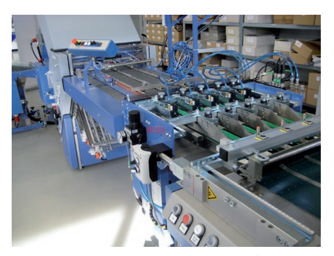
BSR 550 Servo combined with subsequent folding unit