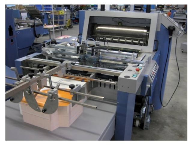
BSR 550 Servo combined with PST 750 pile stacker