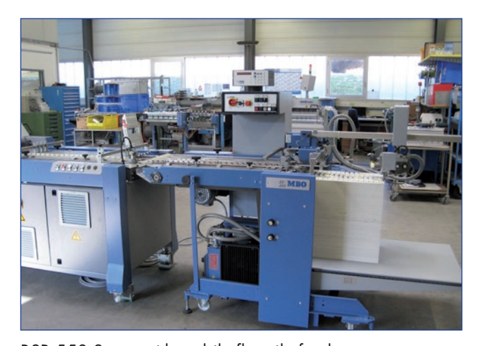
BSR 550 Servo with mobile flat pile feeder