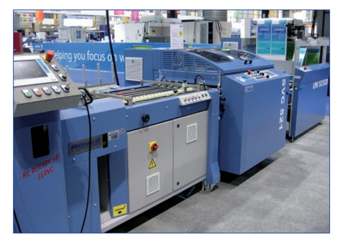
BSR 550 Servo with MBO unwinder and rotary cross cutter