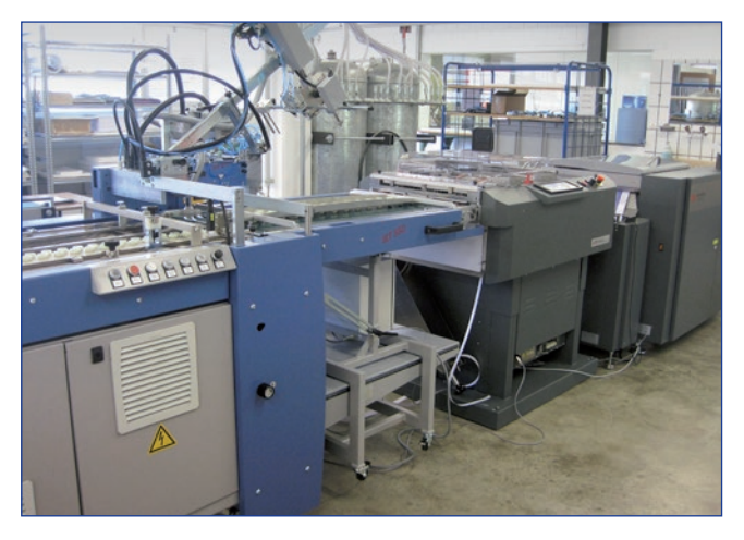
BSR 550 Servo with Tecnau unwinder/cross cutter