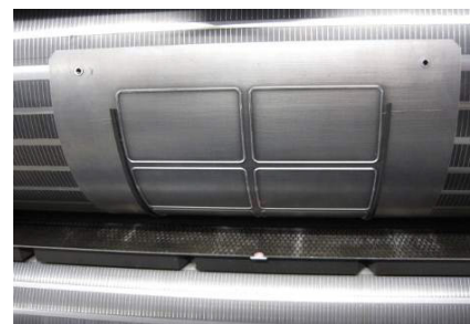
Rotary Die Cylinder

*All features are subject to change without notice.