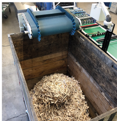
Inclined conveyor belt